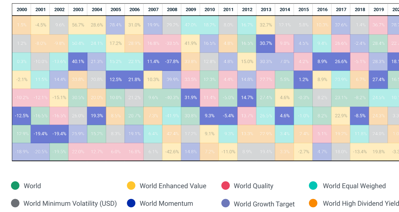
which produced them. There are frequently material differences between backtested or simulated performance results and actual results subsequently achieved by any investment strategy